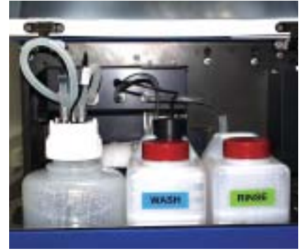
Bulk reagents compartment