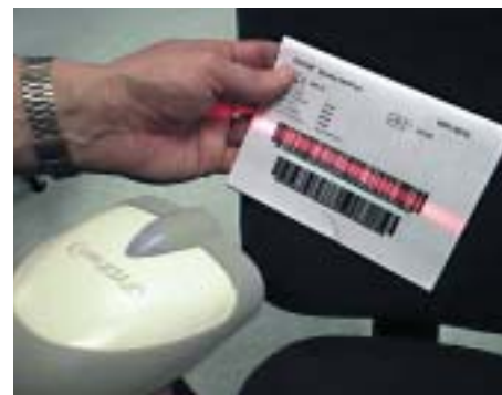
Hand held barcode reader