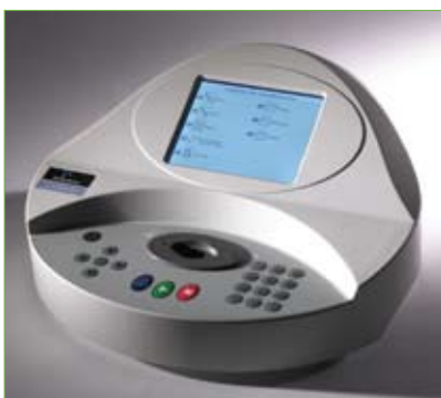
Figure 1. LAMBDA XLS+ UV/Vis spectrometer. Wavelength: 540 nm; Measurement Mode: Absorbance; Cell 10 mm.

Toy safety is a joint responsibility among governments, the toy industries, regulatory bodies and parents. The toy safety regulations are intended to reduce potential risks children could be exposed to when playing with toys. Enforcement of the regulations aims to identify those toys that do not comply with the legislation and remove them from the market. The toxic elements that may be present in toys are heavy metals such as antimony, arsenic, chromium, lead, mercury, etc., which can accumulate in the body and may cause adverse effects. Therefore,