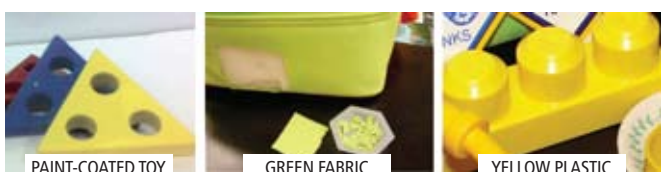
Figure 3. Toy samples.