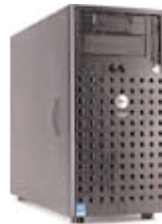
DC/DNS Server Server 3 Windows 2000 Server Windows 2000 Server License (standard W2K license) Windows 2000 Server Client Access License (Terminal service license on license server and distributes client licenses)