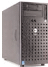
TotalChrom Server Server 1 Windows 2000 Server Functions as a License Manager, Acquisition and Analysis server

Example Configuration: Before deciding on the configuration to use, read the Sizing Systems section that helps outline the configuration that best suits your organization's needs. This is not a suggestion of how TotalChrom should be installed with Citrix, but a configuration that has been implemented and tested within a test environment.