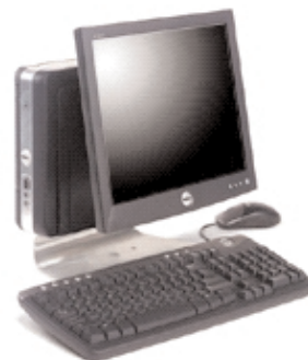
Citrix Client Client 1 Citrix ICA Client Installed TotalChrom 6.2 Client accessible through Citrix Program Neighborhood