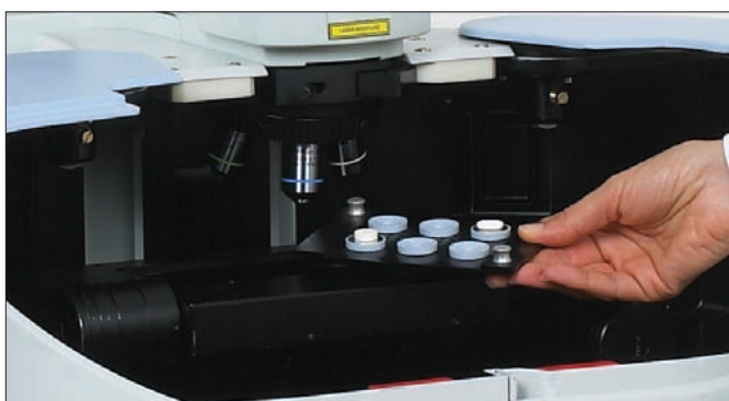
Figure 1. Tablet Holder Plate for motorized stage.