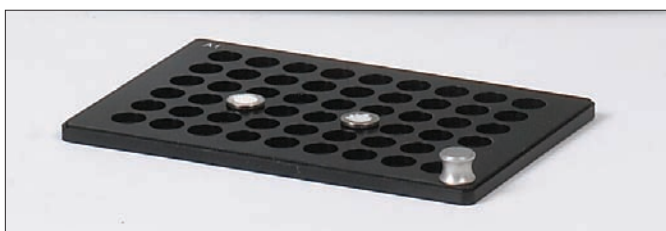
Figure 2. Powder Holder Plate with powder holder cups.

PerkinElmer, Inc. 940 Winter Street Waltham, MA 02451 USA Phone: (800) 762-4000 or (+1) 203-925-4602 www.perkinelmer.com