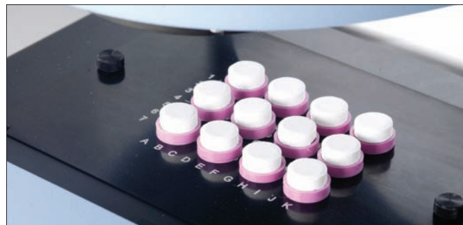
Figure 3. Convenient tablet and powder kits, sample holders and accessories are available for the RamanMicro and Spotlight FT-IR Microscopes.